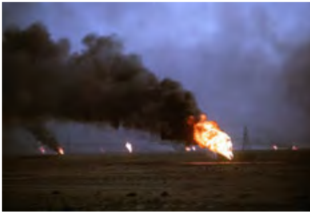
Kuwaiti oil wells set afire by retreating Iraqi troops following Operation Desert Storm.

Gulf War veterans, even before the hostilities ended, began complaining of symptoms with no readily identifiable cause. The symptoms included fatigue, skin rash, headache, muscle and joint pain, memory loss and difficulty concentrating, shortness of breath, sleep problems, gastrointestinal problems and chest pain.