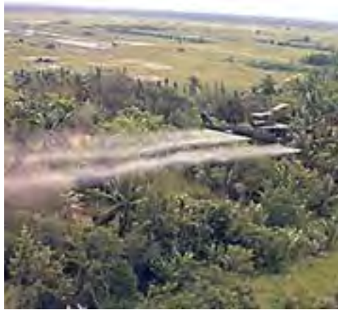
The herbicide Agent Orange was used extensively to defoliate trees and remove cover for the enemy.

The VA in 1981 established a special eligibility program which provides free follow-on hospital care to Vietnam veterans with any health problems whose cause is unclear.