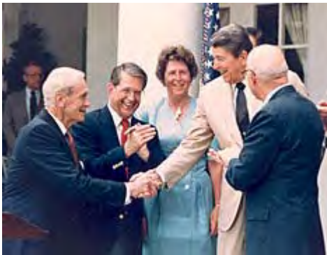
Congressman Sonny Montgomery, left, is congratulated by President Ronald Reagan.

Late in the 1980s, VA dedicated resources to serving homeless and chronically mentally ill veterans. It also responded to the growing numbers of patients with Acquired Immune Deficiency Syndrome (AIDS) with special treatment units and special training for medical staffs.