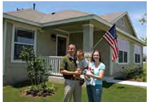
In fiscal year 2005, VA guaranteed 165,854 loans valued at $25 billion.

From 1944 — when VA began helping veterans purchase homes under the original GI Bill — through May 2006, VA issued more than 18 million VA home loan guarantees, with a total value of $892 billion. In fiscal year 2005 alone, VA guaranteed 165,854 loans valued at $25 billion and, at the beginning of fiscal year 2006, had 2.3 million active home loans reflecting amortized loans totaling $202.1 billion. VA’s specially adapted housing programs helped about 587 disabled veterans with grants totaling more than $26 million in 2005.