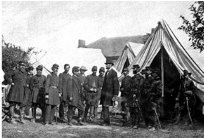
President Lincoln at the Antietam battlefield, October 1862

When the Civil War broke out in 1861, the nation had about 80,000 war veterans. By the end of the war in 1865, another 1.9 million veterans had been added to the rolls. This included only veterans of Union forces. Confederate soldiers received no federal veterans benefits until 1958, when Congress pardoned Confederate servicemembers and extended benefits to the single remaining survivor.