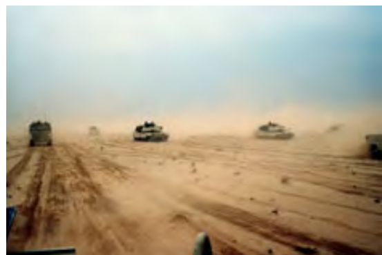
M-1A1 Abrams main battle tanks in northern Kuwait during Operation Desert Storm.

The legislation extended to Persian Gulf War veterans eligibility for wartime-only pensions, medical treatment, educational benefits, housing loans and unemployment payments.