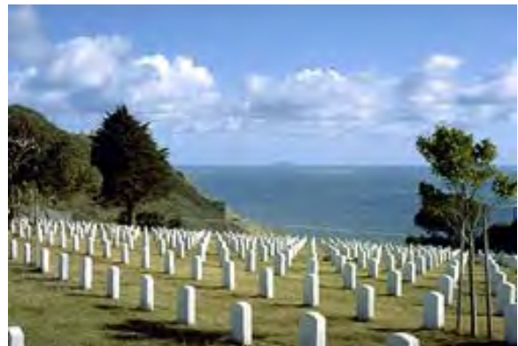
Fort Rosecrans National Cemetery, San Diego, Calif.

In 2005, VA national cemeteries conducted more than 93,000 interments, provided nearly 364,000 headstones or markers for veterans' graves and approximately 488,000 Presidential Memorial Certificates to veteran's next of kin and loved ones to commemorate honorably discharged, deceased veterans. Since 1973, the department has provided more than 9.2 million headstones and markers. Additionally, VA has awarded more than $258 million for the development, expansion or improvement of 63 state veterans cemeteries. In 2005, nearly 21,000 veterans and family members were buried in those cemeteries.