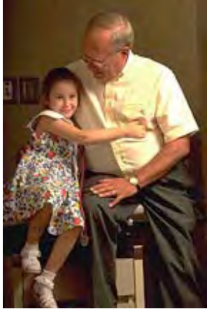
VA programs provide $1.1 trillion insurance coverage.

VA directly administers six life insurance programs and supervises the Servicemembers' Group Life Insurance and the Veterans' Group Life Insurance programs. These programs provide $1.1 trillion in insurance coverage to 4.5 million veterans, active-duty servicemembers, reservists and Guardsmen, plus 3 million spouses and children.