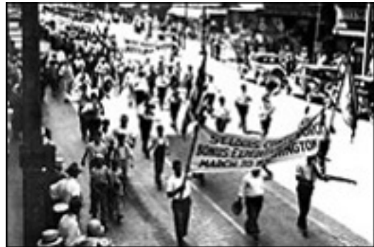
World War I Bonus Marchers

As the Depression worsened, veterans began calling for immediate payment of their "bonuses," as the certificates came to be called. In March 1932, a small group of veterans from Oregon began marching to Washington, D.C., to demand payment. Word of the march spread like wildfire and soon small bands of unemployed veterans from across the country began descending on the nation's capital.