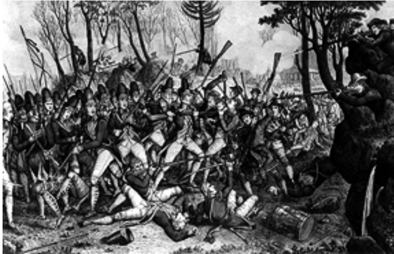
Battle of Lexington, April 19, 1779

From the beginning, the English colonies in North America provided pensions for disabled veterans. The first law in the colonies on pensions, enacted in 1636 by Plymouth, provided money to those disabled in the colony's defense against Indians. Other colonies followed Plymouth's example.