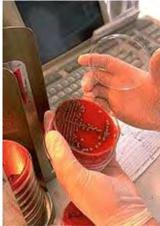
In 2005, VA supported approximately 3,800 researchers at 115 VA medical centers.

pressure. The “Seattle Foot” developed in VA allows people with amputations to run and jump.