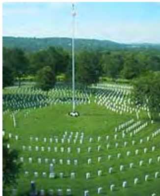
Fayetteville National Cemetery

Proponents of the measure argued that the program would attract more enlistees and improve retention rates. However, initial participation in VEAP was low. And the program was not inducing sufficient numbers to join nor to stay through the initial enlistment. The educational level of recruits also declined.