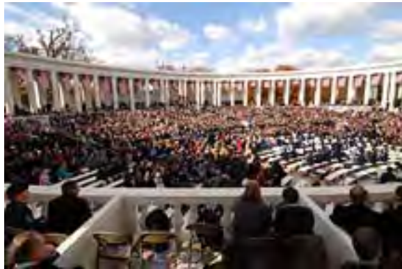
Veterans Day ceremony at Arlington National Cemetery

Of the 24.3 million veterans alive at the start of 2006, nearly three-quarters served during a war or an official period of conflict. About a quarter of the nation's population, approximately 63 million people, are potentially eligible for VA benefits and services because they are veterans, family members or survivors of veterans. VA's fiscal year 2005 spending was $71.2 billion, including $31.5 billion for health care, $37.1 billion for benefits, and $148 million for the national cemetery system.