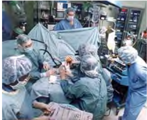
More than 5.3 million people received care in VA health care facilities in 2005.

VA's health care system has grown from 54 hospitals in 1930 to 157 medical centers in 2005, with at least one in each state, Puerto Rico and the District of Columbia. More than 5.3 million people received care in VA health care facilities in 2005, a 29 percent increase over the 4.1 million treated just four years earlier.