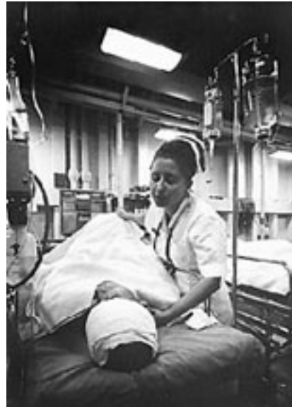
A nurse tends a patient just out of surgery in the intensive care ward of the hospital ship USS Repose (AH-16) off the coast of Vietnam.

Advances in airlift and medical treatment meant that many wounded and injured personnel survived who would have died in earlier wars. By 1972 there were 308,000 veterans with disabilities connected to military service.