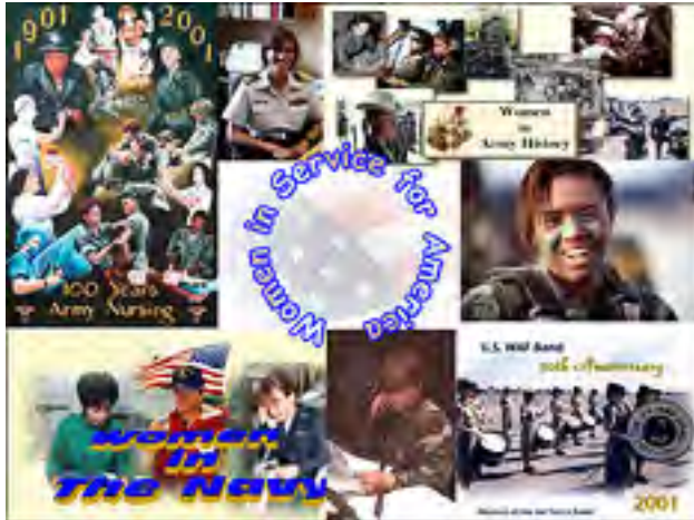
VA's Center for Women Veterans

In response to the growth in the number of women veterans, VA has expanded medical facilities and services for women and increased efforts to inform them that they are equally entitled to veterans benefits. The Veterans Health Care Act of 1992 provided authority for a Variety of gender-specific services and programs to care for women veterans.