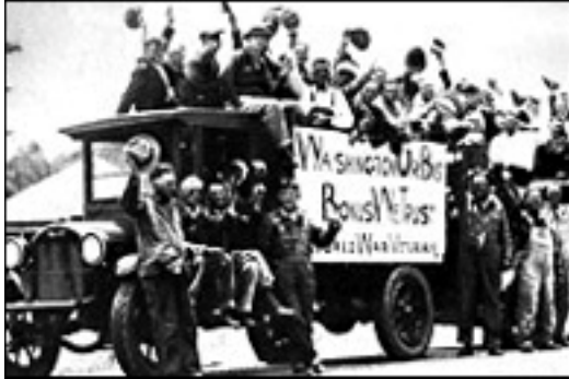
World War I Veterans Descend on Washington, DC

The Great Depression was merciless. The loss of jobs, life savings and confidence left many unable to make a living. Trapped in its wake, World War I veterans suffered tremendous pressure during the economic slump. After returning from the Great War, many faced destitution and did all they could to survive.